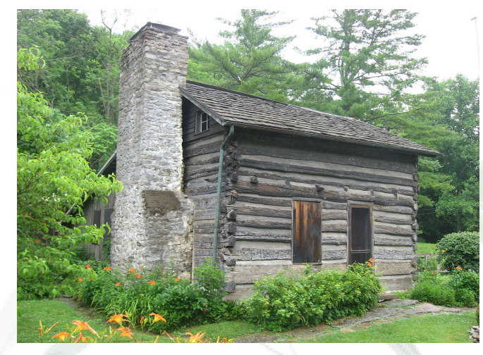
6550 Clough Pike - Anderson Township Historical Society